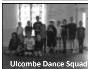
Ulcombe Dance Squad