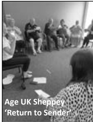
Age UK Sheppey 'Return to Sender'