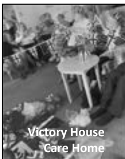
Victory House Care Home