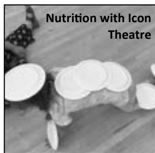
Nutrition with Icon Theatre