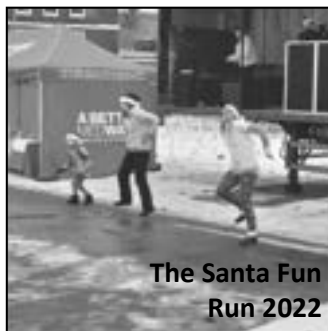
The Santa Fun Run 2022

THE SANTA FUN RUN is something we take part in every year. We go along and warm up the fun runners who are dressed as Santa! Run by Rotary Club of Medway, the fun run supports the Rotary Charities and is hilarious fun! You can get involved with the 2023 fun run now, take a look at their website. 2022 was the most bizarre and authentic yet... it snowed!