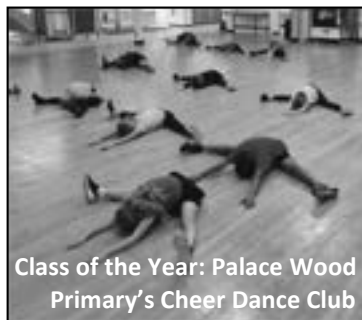
Class of the Year: Palace Wood Primary's Cheer Dance Club