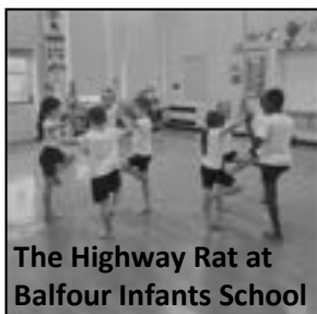
The Highway Rat at Balfour Infants School