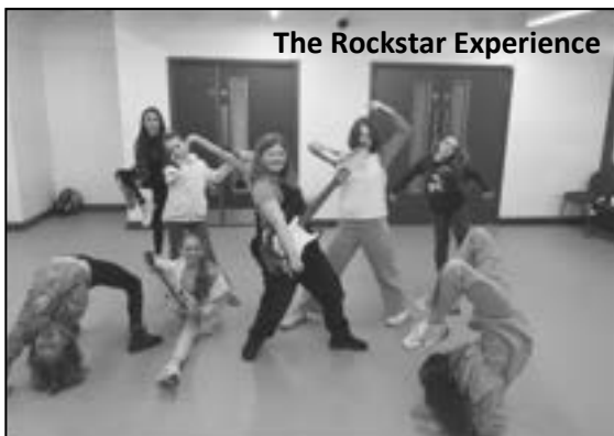
The Rockstar Experience