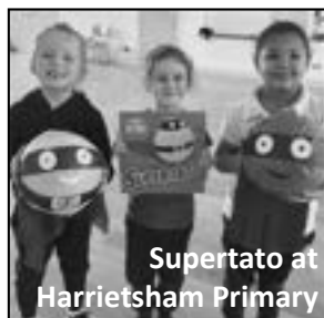
Supertato at Harrietsham Primary