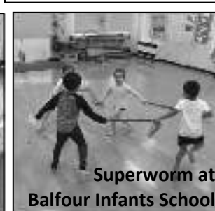
Superworm at Balfour Infants School

BOOK WEEK is always a highlight of the year. This year's books included Handa's Surprise, Harry Potter, Spiderwick and Aliens and Dinosaurs in Underpants! Higham Primary enjoyed a whole school Treasure Island theme and, as always, everyone's costumes were amazing!