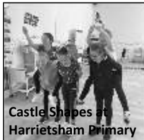
Castle Shapes at Harrietsham Primary

SHAKE YOUR TAIL FEATHER was our Age of Creativity Festival project. Active Armchairs Trainee Facilitators choreographed a dance that could be easily adapted, we filmed it and shared it far and wide. People of all ages and abilities shared their versions. We aimed to raise awareness about dance in care homes and The Holmesdale School's dance club organised a trip to Pilgrims View Care Home for Active Armchairs as a result!