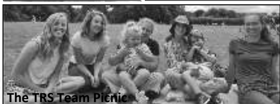
The TRS Team Picnic