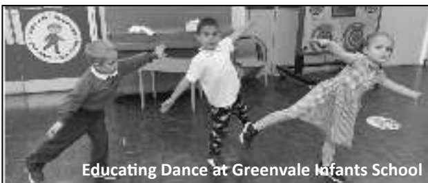
Educating Dance at Greenvale Infants School