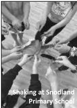
Shaking at Snodland Primary School

SHAKE YOUR TAIL FEATHER was our Age of Creativity Festival project. Active Armchairs Trainee Facilitators choreographed a dance that could be easily adapted, we filmed it and shared it far and wide. People of all ages and abilities shared their versions. We aimed to raise awareness about dance in care homes and The Holmesdale School's dance club organised a trip to Pilgrims View Care Home for Active Armchairs as a result!