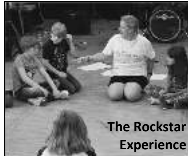
The Rockstar Experience

HOLIDAY CLUBS have taken off this year. From 2 to 18, across Kent and in many different dance styles we've spent 100s of hours dancing. Highlights were The Rockstar Experience, where we boosted confidence and explored our inner rock stars, and Emergency Services themed Educating Dance classes with T W Tutors. We're already working on the next holidays so keep an eye out for us!