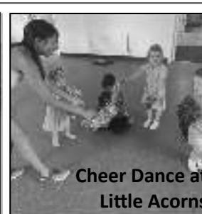
Cheer Dance at Little Acorns