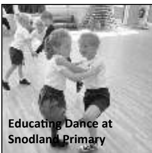
Educating Dance at Snodland Primary