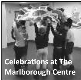
Celebrations at The Marlborough Centre