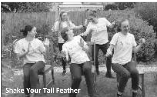
Shake Your Tail Feather