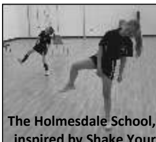
The Holmesdale School, inspired by Shake Your Tail Feather

THE TEAM PICNIC was such a success last year that we went back to Teston Bridge Country Park again to enjoy the sunshine and some well deserved TRS Team social time.