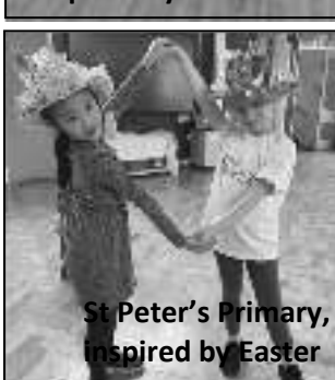
St Peter's Primary, inspired by Easter

DANCE CLUBS inspired by Waves, Animal Masks, Seasons and many more have taken place all over Kent and there have been lots of performances too. Almost 400 participants have the chance to dance in our clubs every week!