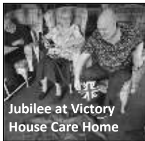
Jubilee at Victory House Care Home

THE QUEEN'S JUBILEE celebrations were incredibly exciting for everyone. We celebrated through dance and had a wonderful time. We even wrote a blog post about it!