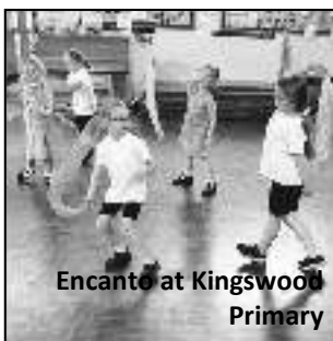
Encanto at Kingswood Primary