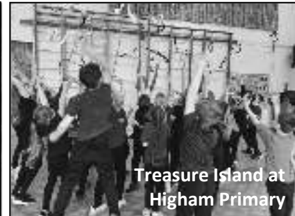
Treasure Island at Higham Primary

KEEP UP TO DATE THROUGHOUT THE YEAR... FB: therightstepdc Twitter: @The_Right_Step Insta: the_right_step YouTube: therightstepdc www.therightstepdc.co.uk